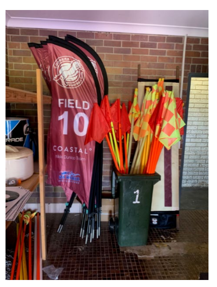
Field 1 - Northern End (Field 1 pair of full-sized goals)